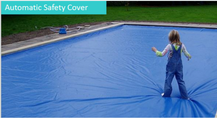
Automatic Safety Cover